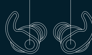
Multi Function Button (MFB)